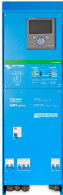
EasySolar 3 kVA