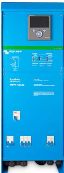
EasySolar 5 kVA

http://www.victronenergy.nl/support-and-downloads/software/